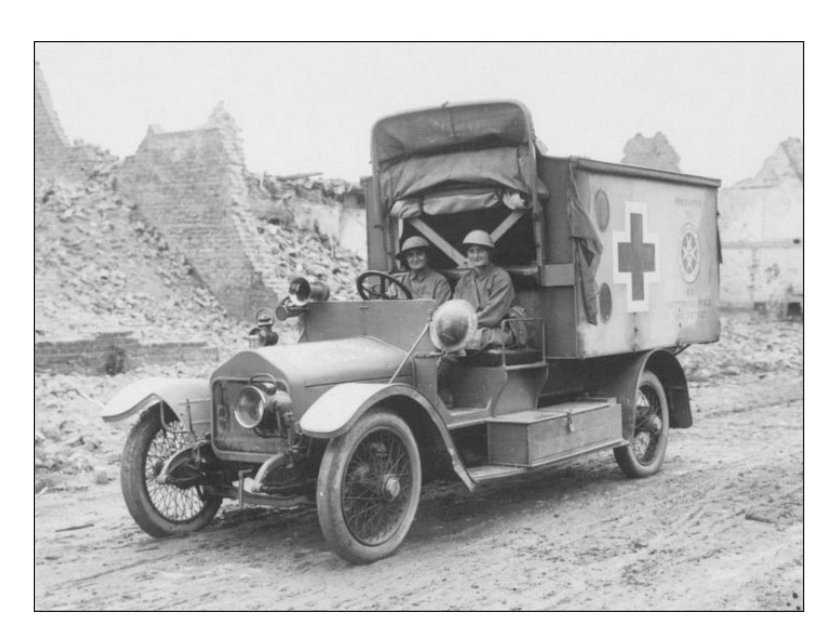
[Female ambulance drivers on the Western Front in 1917]