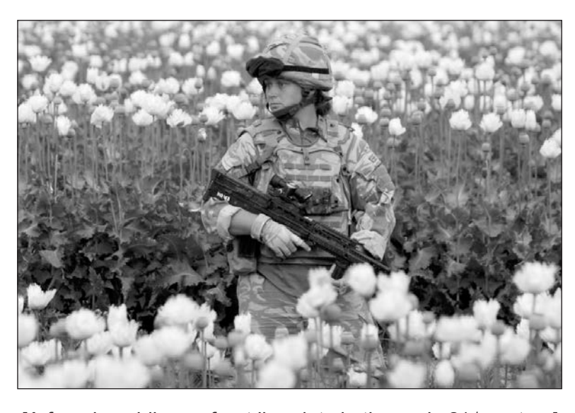
[A female soldier on front line duty in the early 21st century]

Use Sources A, B and C to identify one similarity and one difference in the role of women in war over time. [Use at least two of the sources to answer the question.]